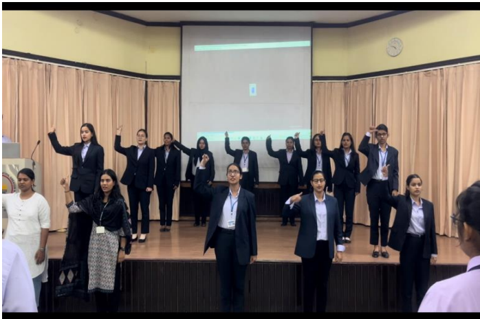
ISL National Anthem