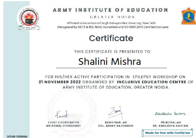
E-certificate issued to all participants