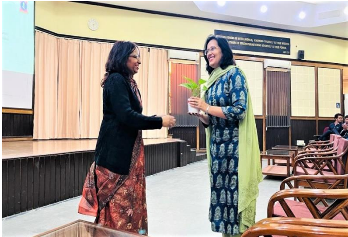
Facilitation of Resource person